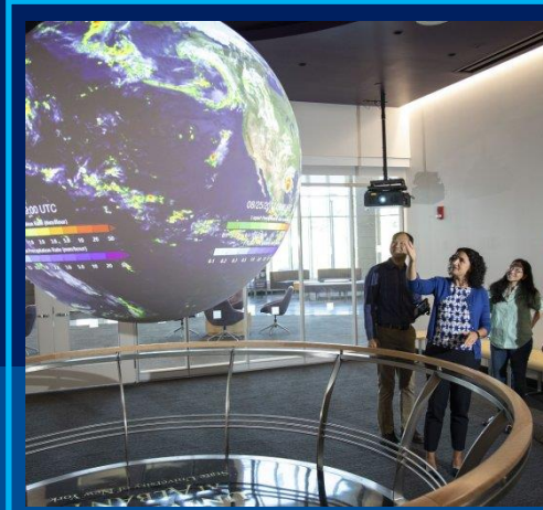
Research and Scholarship