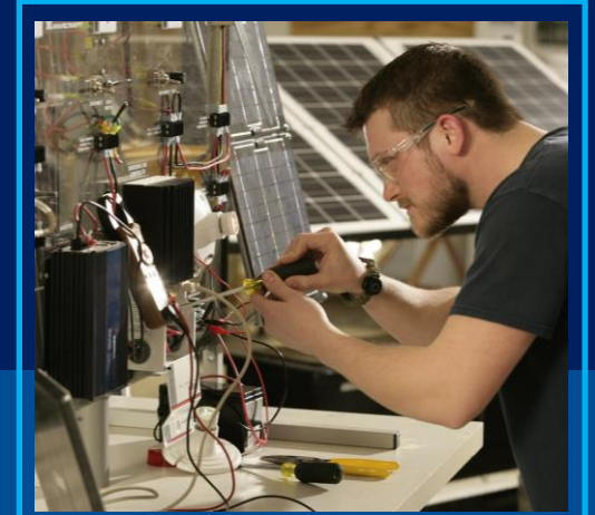
Economic Development and Upward Mobility