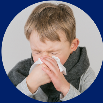
Sick Child or Family Member